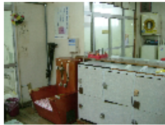
There is a massage chair