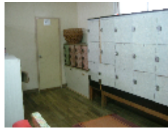
An individual locker