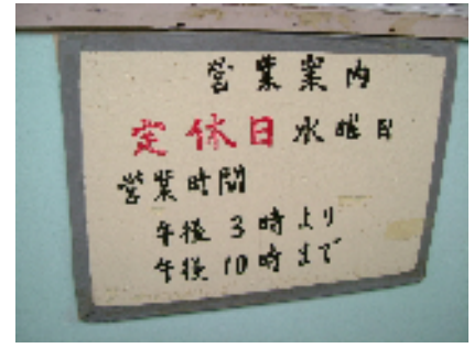
A guidance plate