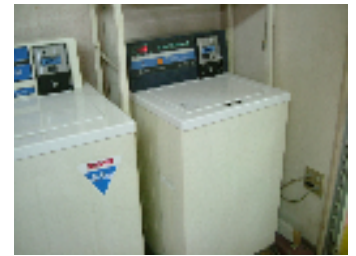
A pay washing machine